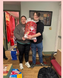
The Swertfeger family